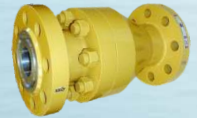
Düsen-Rückschlagventile Nozzle Check Valves

Types: KDGT, AKF-T, KDT-RBS DN: 200-2000 (8"-80") PN: 6-40 (class 125-300) Temp: 0° → +80°