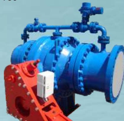
Zentrische Kugelhähne Offset Flanged Ball Valves

Types: KKGH DN: 50-600 (2"-24") PN: 6-100 (class 125-600) Temp: 0° → +300°