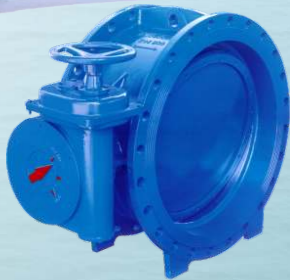
Flansch-Absperrklappen Flanged Butterfly Valves

Types: KD-G, AKF, AKF-M3 DN: 100-2500 (4"-100") PN: 6-40 (class 125-300) Temp: -20° → +400°