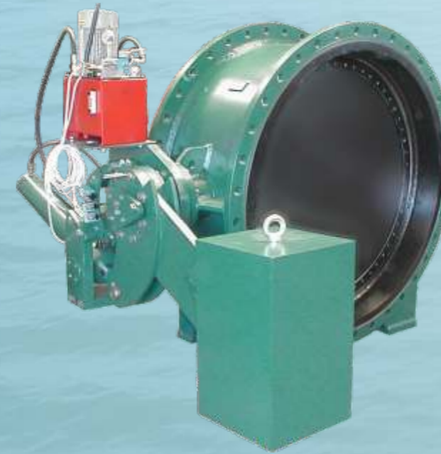
Turbineneinlauf-Klappen & Rohrbruch-Klappen Turbine inlet & Pipe Burst Valves

Types: 8RA, 8RB, 8RK, 8RK-M, 8RK-E DN: 100-1400 (4"-56") PN: 6-100 (class 125-600) Temp: 0° → +350°