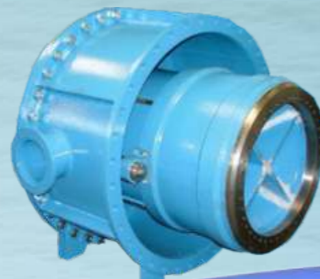
Kegelstrahl-Schieber Hollow Jet Cone Valves

Types: KGS DN: 500-1000 (20"-40") PN: 6-25 (class 125-150) Temp: 0° → +80°